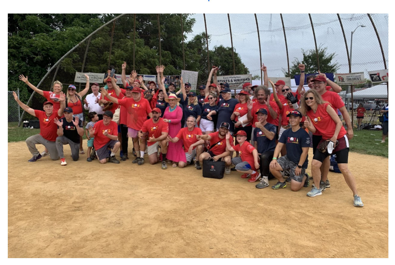
The Retreat, the Elinor Whitmore Early Childhood Center, Phoenix House Academy and East End Hospice.

Corporate supporters receive a variety of benefits including invitations to the pre-game V.I.P party, a banner on the outfield fence or backstop and a page of advertising in the game program. Sponsors will also be recognized during the game during the broadcast and filming of the game.